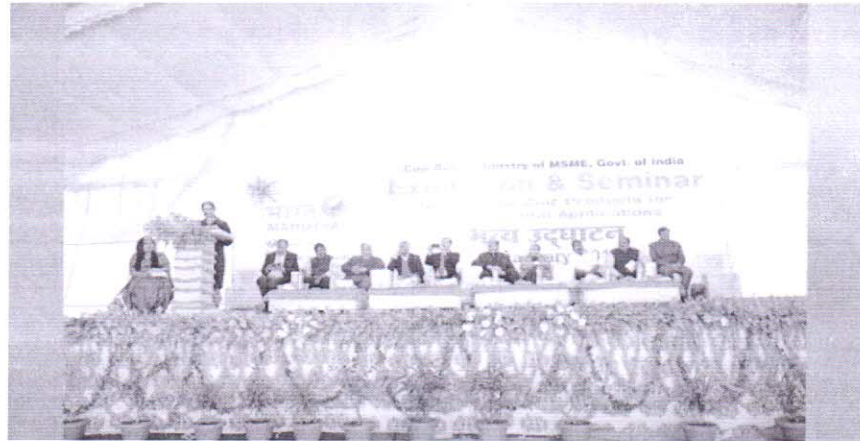
Bharath Mahotsav 2017 at Nishad Gunj, Lucknow