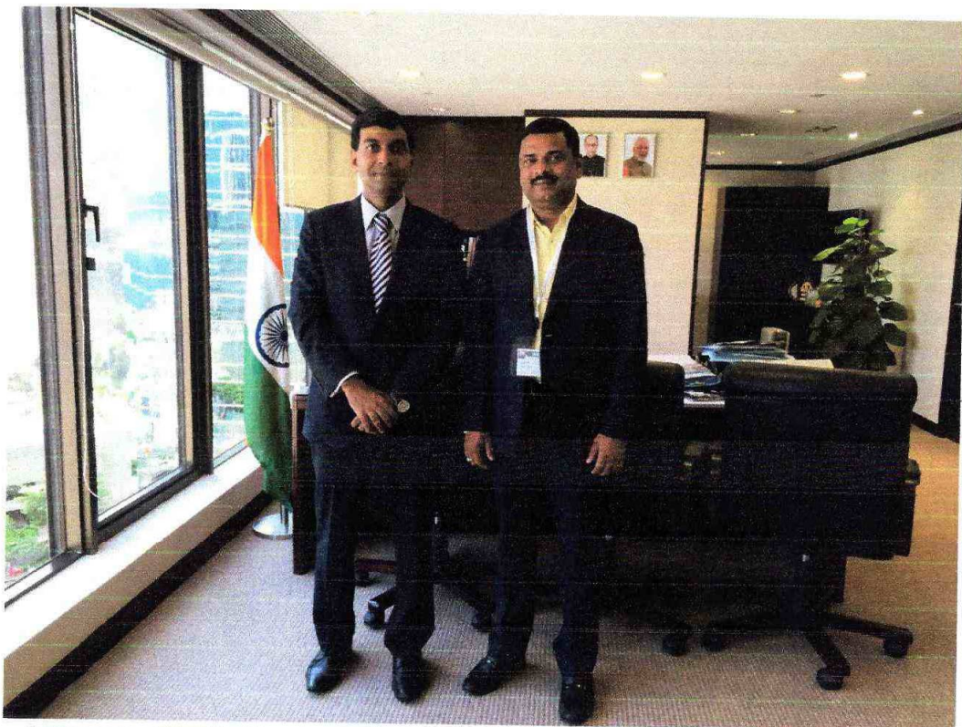
Interact with Sh. Prashant Agarwal, Consul General, Consulate of India to Hong Kong

The space taken at Hong Kong Convention and Exhibition Centre is too small, not enough to display of products brought Coir Board and Exporters. In this regard the two exporters participated along with the Board's stall, suggested to take more space in future participated in the fairs, so that products brought from India can be displayed properly, if more space is taken by the Coir Board.