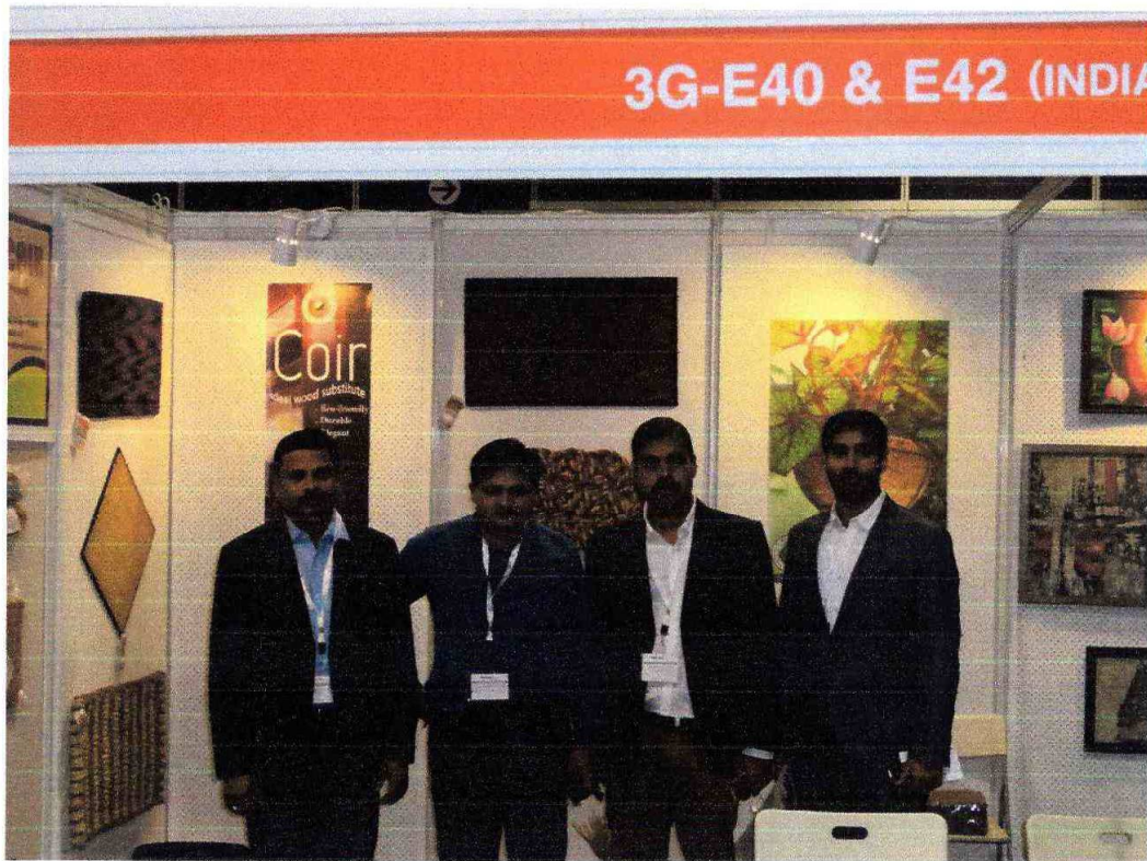
Interaction with Exporters in Coir Board Stall

Two exporters were participated in the fair namely. M/s.Viva Agtech Products, Pollachi and National Coir, Odisha.