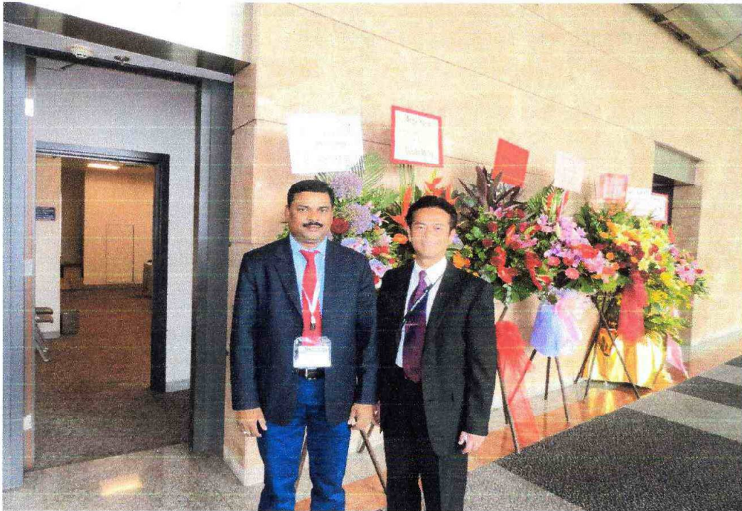
The show manager is Comasia Limited and Mega Expo (Hong Kong) Limited

This Year 3,380 exhibitions in more than 4,500 stands from over 30 countries and regions including Australia, Bangladesh, Czech Republic, France, Germany, Hong Kong, India, Indonesia, Ireland, Israel, Italy, Japan, Malaysia, Mexico, Myanmar, The Netherlands, Nepal, Pakistan, the Philippines, Russia, South Korea, Spain, Sri Lanka, Taiwan Thailand, Turkey, United Kingdom, the USA and Vietnam are presenting their new design and latest innovations.