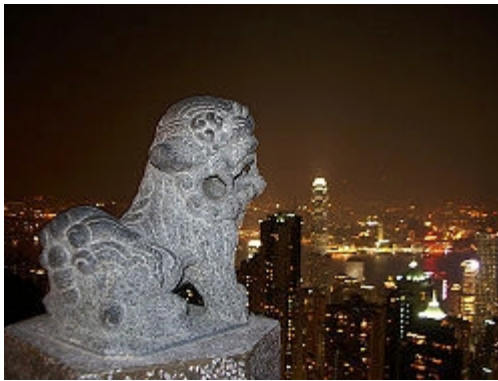
A shot of Hong Kong's Million Dollar View