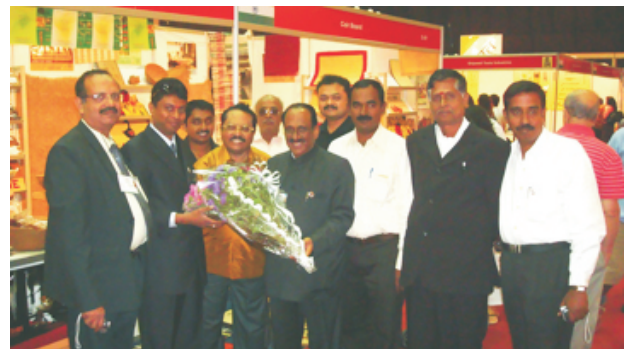
Exporters from India receiving Chairman, Coir Board at India Show 2009 Pavilion.

(d). Tourism related infrastructure : In view of foreign investment for building hotels and resorts in Chile with the assistance of Indo Chilean Chamber, possibility of coir cushions, coir mattresses coir pillows, and coir ply may be explored.