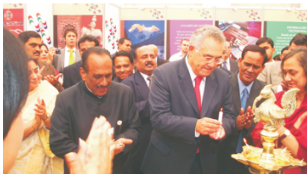
Chairman, Coir Board with HE Mr. Hugo Lavados Montes, Honorable Minister of Economy, Development & Reconstruction at the inaugural ceremony of India Show 2009 at Chile.

the 60th anniversary of the establishment of bilateral relations between two countries, she was unable to attend the function. Mr. Hugo Lavados Montes, Honorable Minister of economy, development and reconstruction has inaugurated the India Show 2009. Chairman, Coir Board was in attendance at the function. On the succeeding days simultaneously a series of seminars on trade and investment opportunities were arranged by VITC, Karnataka, and NSIC.