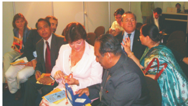
Chairman, Coir Board with HE Mrs. Marigen Horn Kohl Venegas, Honorable Minister of Agriculture, Government of Chile at valedictory function at India Show 2009, Chile.

In an informal chat with the Honorable Minister of Agriculture during her valedictory meeting and subsequent visit to Coir Board Pavilion, Chairman, Coir Board introduced a wide range of novel designs of coir products and briefly explained the efforts made by Coir Board recently in promoting coir products to