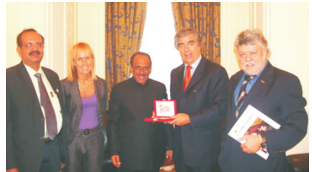
Chairman Coir Board with the officials of National Chamber of Commerce & Santiago Chamber of Commerce

National Chamber of Commerce and Santiago Chamber of Commerce jointly welcomed Chairman, Coir Board and assured to extend all help in issues in international trade and assured to send all publications, reports and economic forecasts for the benefit of Indian exporters. Among others, some of the basic points emerged on the discussions includes Chile's good opportunity in wood industry and potential in the areas of copper mines, growing retail sector and existence of strong credit card system .