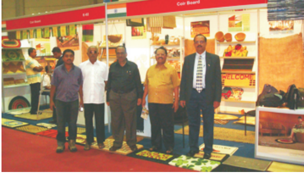
Chairman , Coir Board with Exporters in the Coir Board pavilion.

Chairman, Coir Board profusely thanked the Embassy of India for the honour and outpouring hospitality during its eventful stay at Chile.