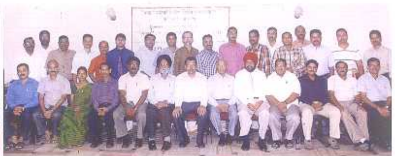
Participants of the MDP at Alleppey