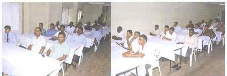
Participants of the MDP at Pollachi